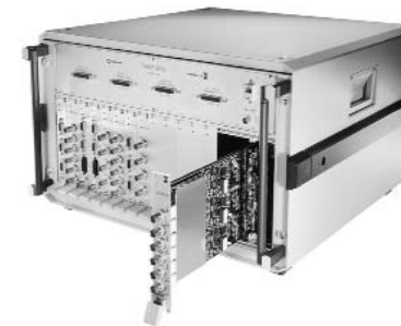
Figure 2 Model 4990 with inserted cards