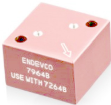
Figure 2: Example of a triaxial mounting block designed for use with accelerometers that have a center CSM

If the above accelerometers are going to be used in a single axis configuration, the location of the CSM is of little (if any) importance as long as the position of the CSM is identified in case rotation information is to be derived. This paper will focus on the CSM of an accelerometer array in a triaxial configuration.