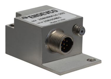
STANDARD TOLERANCE INCHES [MILLIMETERS] .XX = ± .02 [.X = ± .5] .XXX = ± .010 [.XX = ± .25]